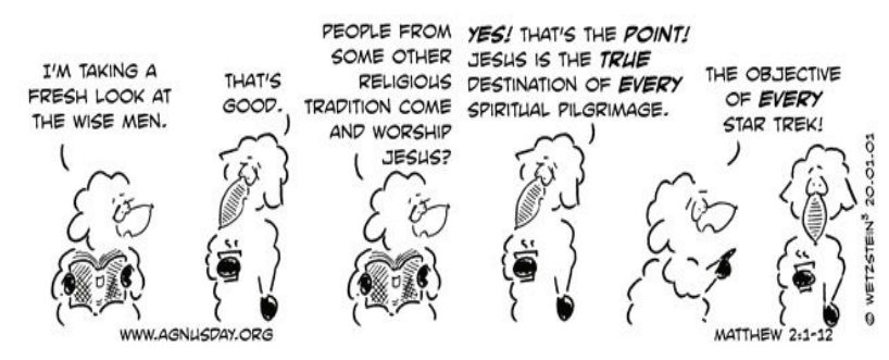
Agnus Day appears with the permission of <u>www.agnusday.org</u>